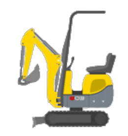
Compact excavator 803