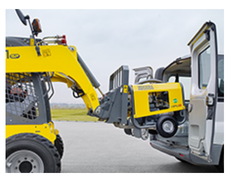
Compact and practical: The loading dimensions of 930 x 720 x 1,000 mm are ideal. And four sturdy tie-down lugs ensure rapid transport.