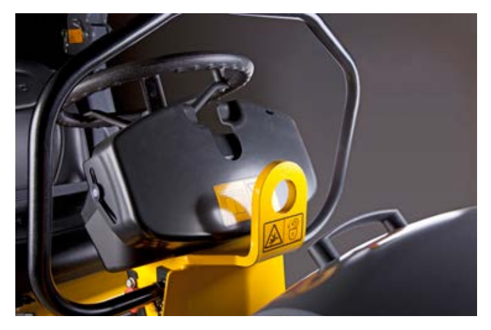
A robust central lifting eye allows fast and easy loading.