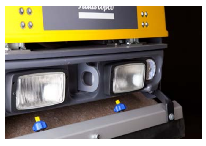
Pressurized sprinkler system with a powerful water pump and with self draining sprinkler tubes and nozzles.