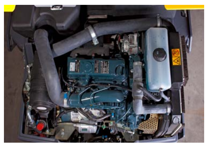
Silent, powerful water cooled Kubota diesel engine. The large easy-to-open engine hood contributes to great accessibility.