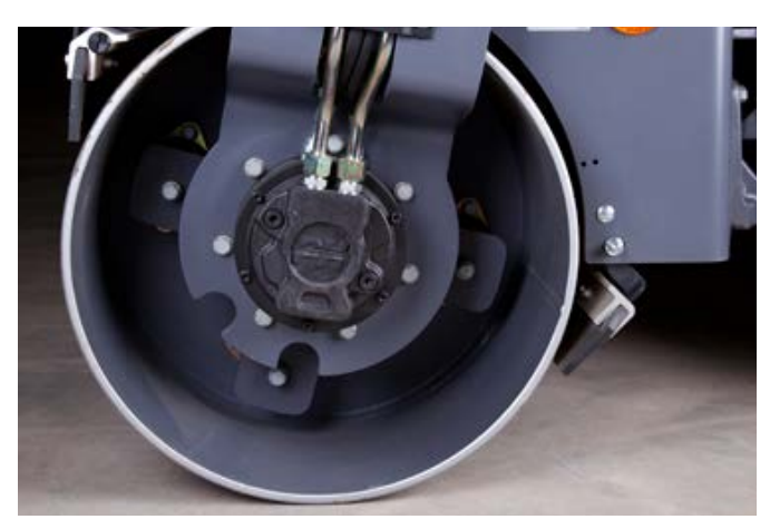
Big drum diameter makes compaction easier even on soft tricky asphalt mixes. Thick drum shells for long life.