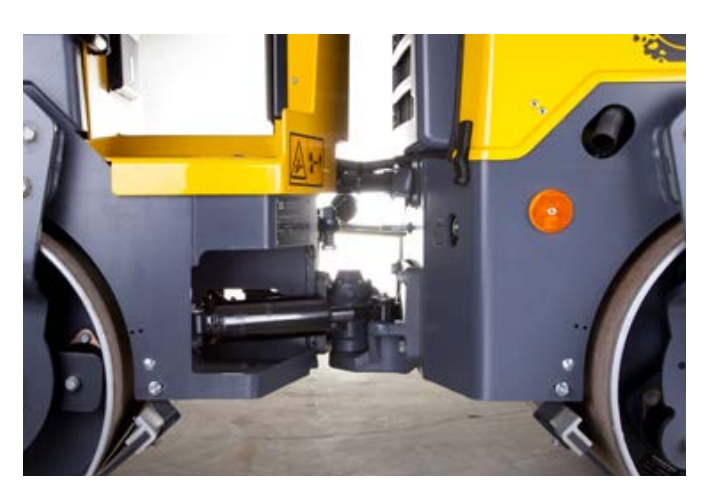
Long service intervals together with maintenance free steering hitch and steering cylinder contribute to a minimum of maintenance.