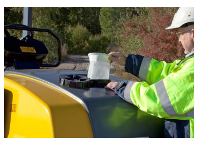
The water tank has a large opening for easy filling.