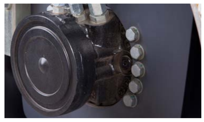
Fail safe brakes on both drums (or drum + combi wheels) which apply automatically in the event of failure in engine, hydraulics or electrical fault in the brake system.