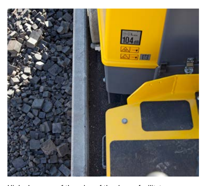
High clearance of the edge of the drums facilitates compaction close to high curb stones. Excellent view over the drum edges for better control and compaction results.