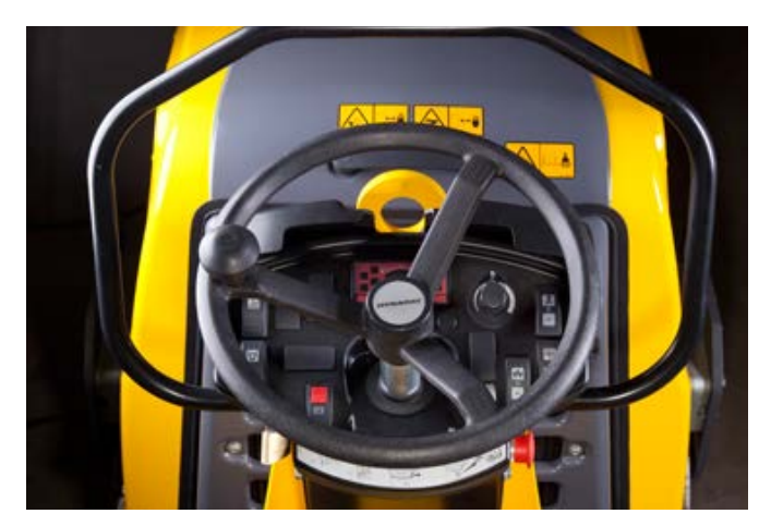
Easily readable instrument panel with fuel gauge. Very low vibration levels in the operator's platform.