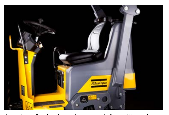
A spacious vibration damped operator platform with comfort seat and dual forward/reverse levers for total operator comfort.