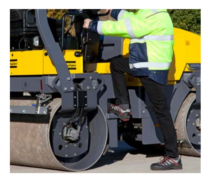
Sturdy handgrips and ergonomic steps enable safe boarding.