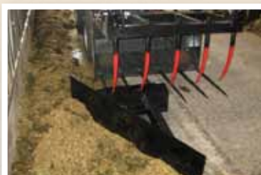
Scraper for manure forks