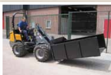
Horse manure containers

- Giant front linkage - 3 point linkage Width: 200 cm