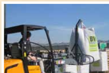
Hoisting frames for big-bags

Max. capacity: 500 kg Max. capacity: 350 kg Pushed in: 100 cm Pushed in: 150 cm Slid out: 160 cm Slid out: 250 cm