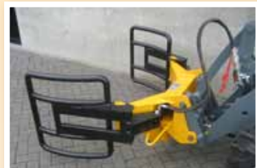
Bale clamp for round bales

Clamp open: Ø150 cm Clamp closed: Ø107 cm Own weight: 165 kg