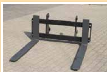
Pallet fork heavy

Max. 2500 kg Forklength: 100 cm Forklength: 120 cm