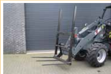
Bale forks standard

Single clamp: 150 kg Double clamp: 220 kg Bales max. Ø140 cm