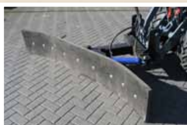
Feed- and manure scrapers