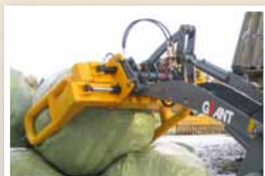
Bale clamp universal heavy

Clamp open: 190 cm Clamp closed: 72 cm Own weight: 220 kg