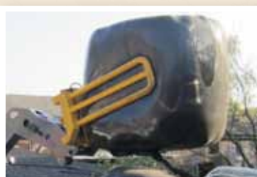
Bale clamp universal compact

Clamp open: 115 cm Clamp closed: 72 cm Own weight: 185 kg