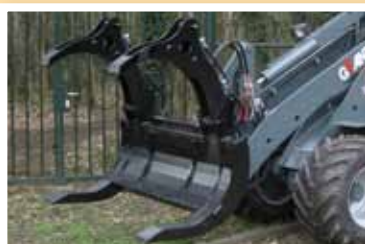
Tree clamp horizontal

Standard version for drills until Ø50 cm. Planetary drive for drills until 100 cm. Leak-oil necessary