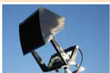
High tip buckets