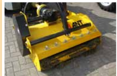
Flail mowers 3 point linkage

Cutting width 100 cm Cutting width 130 cm - Parallellogram - Parallellogram - Required hydr. 33 ltr - Required hydr. 42 ltr Leak-oil necessary