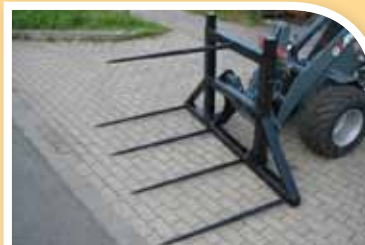
Bale forks heavy

2 tines under 1 tine above Tine length: 100 cm