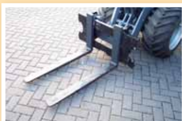
Pallet fork standard

4 tines under 1 tine above Tine length: 100 cm