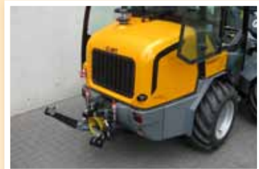
3 point linkage

"Categorie 1" version Max. capacity: 250 kg Available for Giant D243S to V452T X-tra HD