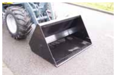
High volume buckets