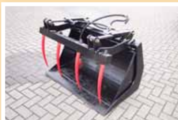
Waste buckets with clamp