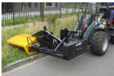
Flail mowers side extension

Various options for Giant sweepers: - Sidebrush - Hydr. emptying - Hydr. angling - Extra large nose wheel - Spray installation