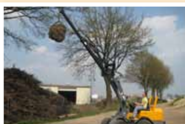
Hoisting frames heavy

Hydraulic drive Various diameters Leak-oil necessary