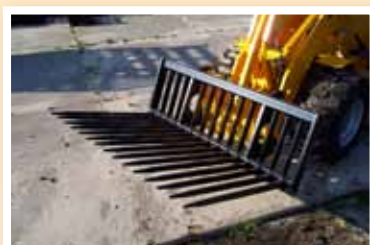
Broken stone forks

Telescopic reach: 80 cm Telescopic reach: 100 cm Extra hydraulic function on pallet lift is optional.