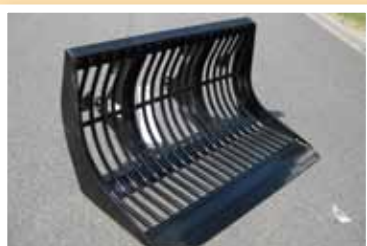
Waste buckets heavy