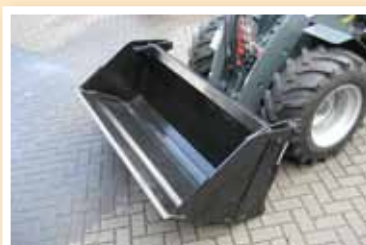
4 in 1 buckets