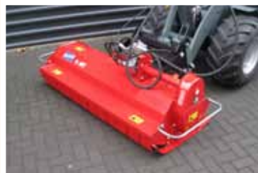
Flail mowers front extension

Cutting width 100 cm - Required hydr: 33 ltr - Hydraulic folding - Working range -45° - Soil following +90° - "Y" flails Leak-oil necessary