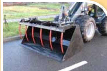
High volume buckets with clamp