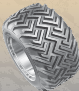
31x15.5-15 TR 06 (80x37 cm) 128 cm machine width