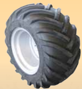
31x15.5-15 AS (80x37 cm) 128 cm machine width