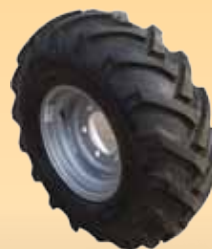
10.0/75x15 AS (76x26 cm) 104 cm machine width

The Giant wheel loaders are equipped with the latest Kubota diesel engines. Which meet the latest emission requirements. The engines are cleaner and have less CO 2 emissions. Standard machines are fitted with large water and oil coolers. The engines are mounted on specially designed silent blocks so that vibration and noise level are reduced to a minimum. In order to increase the comfort Giant wheel loaders have silent blocks under the driver's platform. With a luxury suspension seat with arm and headrest. This machine gives the luxury that every driver want. With the standard hydraulic quick-change system is the connecting and disconnecting of the attachments very easy.