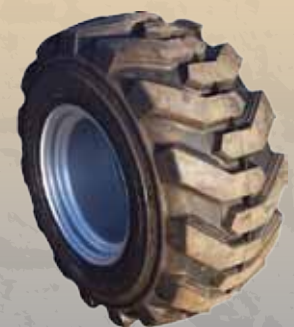
31x15.5-15 Skid (80x40 cm) 132 cm machine width