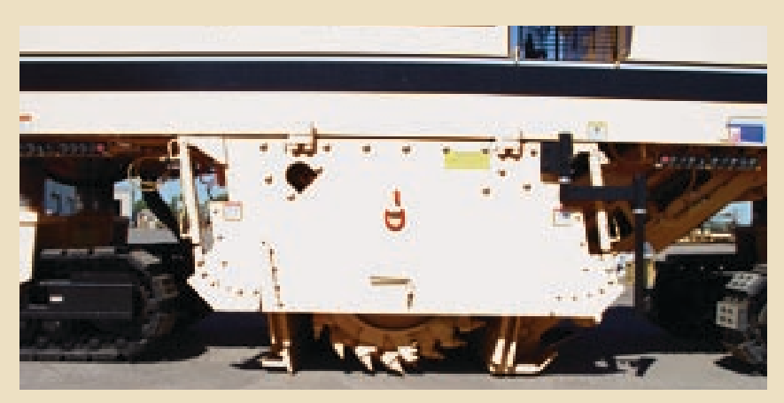
PR600C components are modular for fast removal and maintenance.