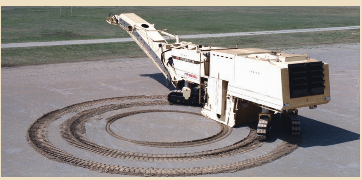
The PR600C's four-track stance gives it an 8 ft (2,438 mm) turning radius.