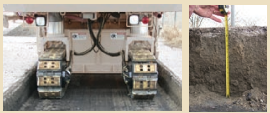
PR600C's power makes 14 in (355 mm) deep plunge cuts easy.

Designed for high production and minimal downtime, PR600C components are modular for fast removal and maintenance. Even the cutter assembly bolts in place for quick changes.